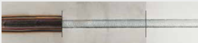
/ CrNi before cleaning