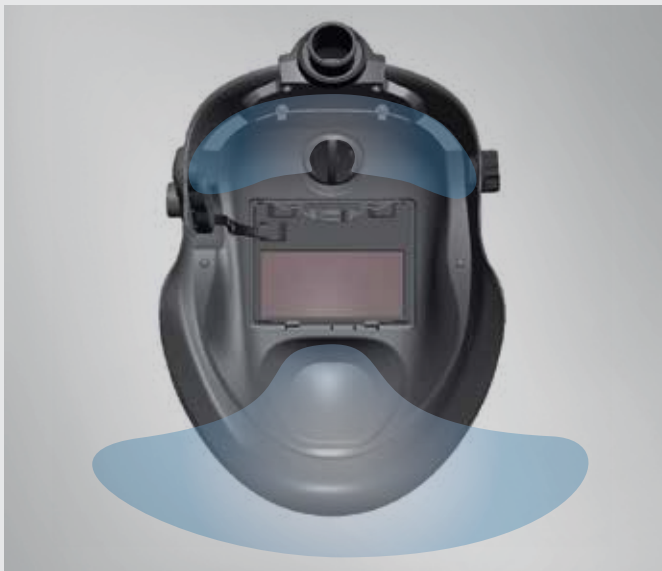
/ Controllable air-flow for the mouth and forehead zones.

/ The fresh-air supply is certified to EN 12941:1998 TH3P. This lets welders work in a clean environment even when the ambient air at the workplace has up to 20 times the maximum allowable particulate concentration.