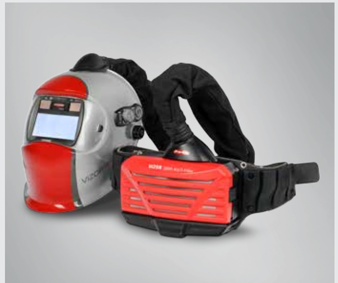
/ The Vizor 3000 Air/3Filter fan-filter unit protects the user from particles, welding fumes and dust.

/ Finally the new generation of Air/3 models have an improved fastening scheme of the hose that gives users even greater freedom of movement.