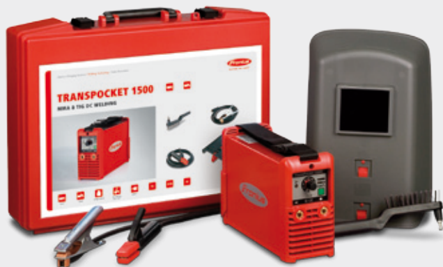
/ Systemcase 1500 TIG

/ Lightweight and portable, and so right at home on every worksite.