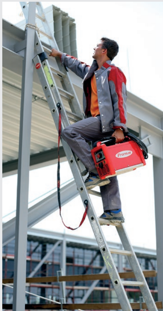
/ Lightweight and portable, and so right at home on every worksite.